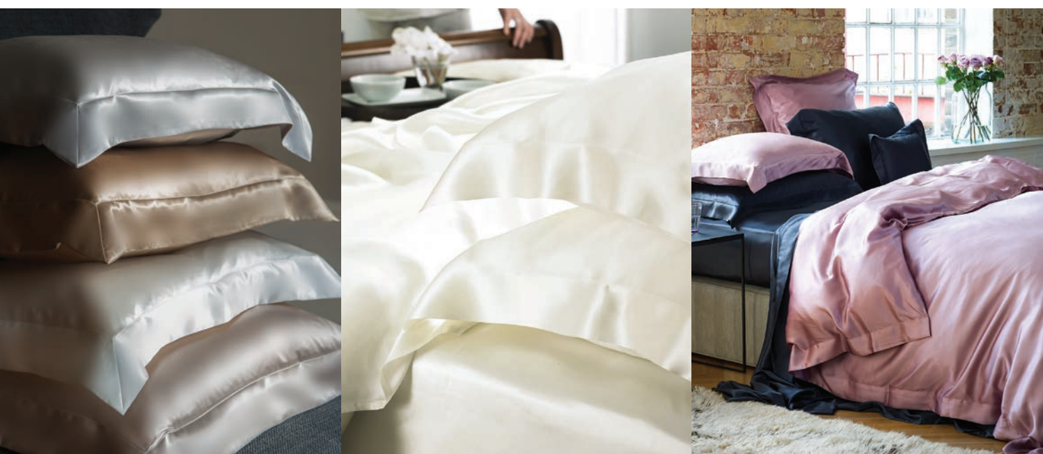
Left to right

Silver grey, taupe, ivory, nude, ivory, pink & charcoal